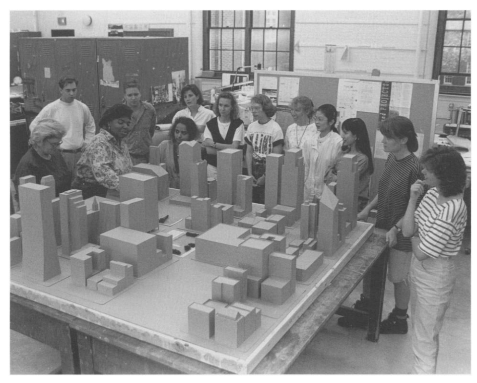
10. Is it possible to imagine an architecture school where roles are reversed—where most students and faculty are women? Unfortunately, this photo had to be staged.