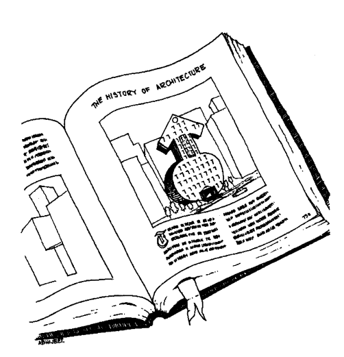
4. Most architectural history books ignore the contributions of women. The reasons for this are complex. It is hoped that future textbooks will be different.

Similarly, we contend that the climate of architectural education for men and for women, even within the same schools, is often dramatically different. At times, the climate of architectural education for women is indeed chilly. When gender inequity permeates the educational context of the architectural curriculum, it diminishes the educational development of many women. It also retards the progress of the discipline, making it all the more difficult to open up new avenues for different perspectives, criticism, and thought.