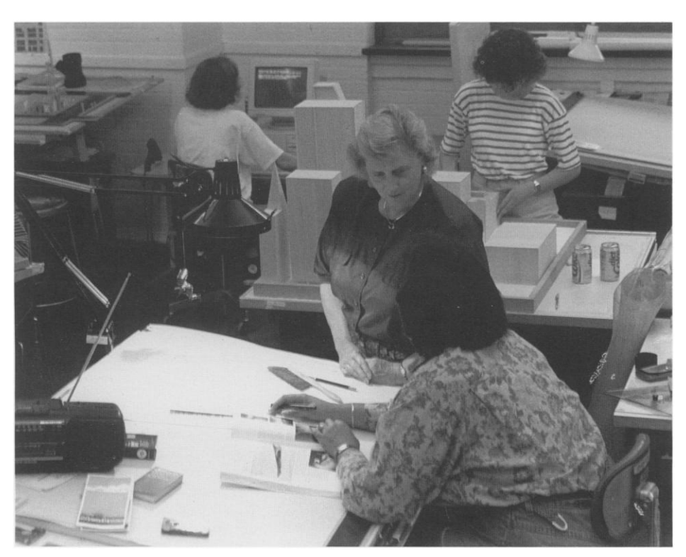
11. More female students and faculty are needed to help architectural education better respond to the changing demographics in our society.

the dominant circle—thus moving from a kind of tunnel vision to a vision of the profession that is much more inclusive. Workshops on such topics as sexual harassment in the studio or communication in the desk crit and jury can help sensitize both students and faculty who may otherwise be unaware of these issues. These workshops should be directed not only toward gender, but also toward race and class. Euro-American, middle-class students—be they male or female—who come from relatively homogeneous, insular communities are often not sensitized to the perspectives of students from different cultures and social classes. As stated by Shirl Buss: